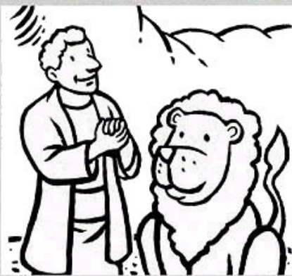
Daniel in the Lions' Den

Daniel was a leader. Other leaders were jealous, so they made the king promise to throw into the lions' den anyone who prayed to Heavenly Father. Daniel prayed to Him and was thrown into the lions' den. But Heavenly Father sent an angel, who kept the lions from hurting Daniel.