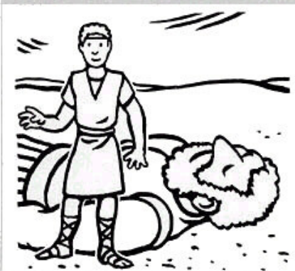
David Defeats Goliath

The king didn't know that Esther, the queen, was a Jew. Haman had tricked the king into commanding that all the Jews be killed. Esther and her people fasted and asked Heavenly Father for help; then she gave a banquet for the king and Haman. At the banquet, she told the king the truth. The king had Haman put to death, and the Jews were saved.