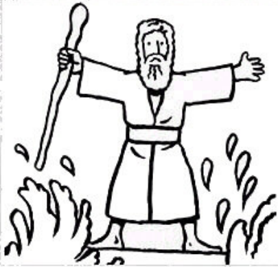
Moses at the Red Sea