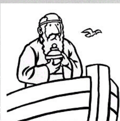
Lehi Goes to the Promised Land

David's brothers were in an army fighting the army of Goliath. Goliath was a giant. If any man could kill him, his army promised to stop fighting. Even though David was only a young boy, with Heavenly Father's help, he killed Goliath, and Goliath's army ran away.